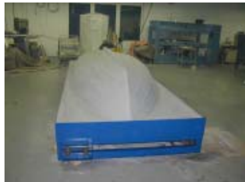
grinded mould ready for production