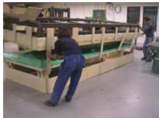
pattern and mould support are fixed together distance between pattern and mould support: 50 mm