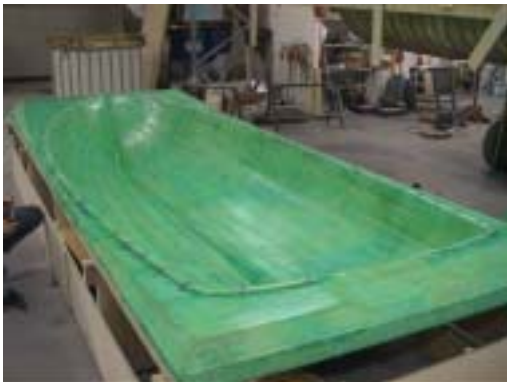
pattern with release agent