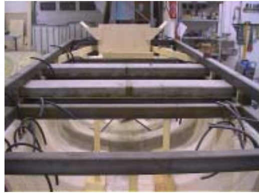
mould support with vacuum pipes