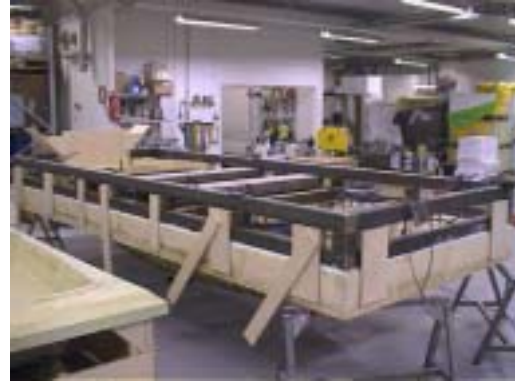
fibre glass mould support as reinforcement with cooling and vacuum pipes