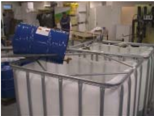
ALWA-MOULD D casting resin