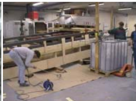
to avoid air between casting and support the pattern was slope down