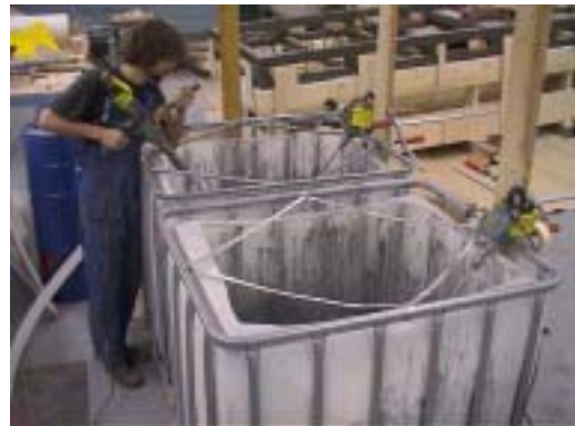
mixing of casting resin and aluminium filler homogeneous