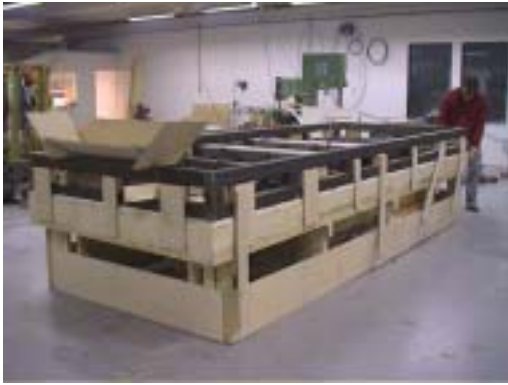
pattern and mould support are sealed up and screwed.