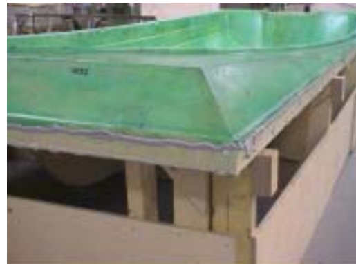
seal up with silicone between pattern and mould support