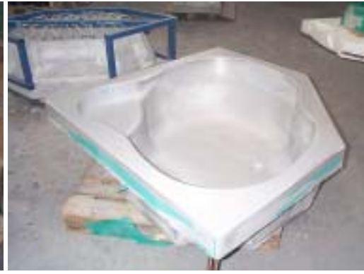
mould without frame