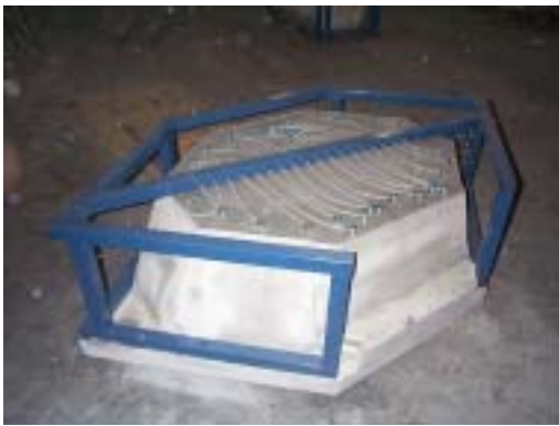
mould with frame and vacuum fittings