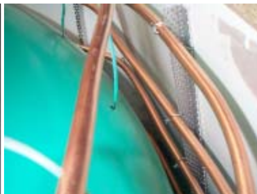
fixing of cooling tubes