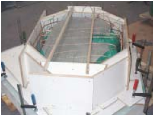
pattern with fixed casting box