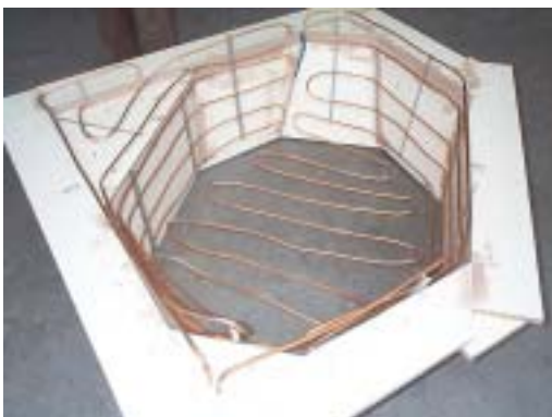
casting box with cooling system