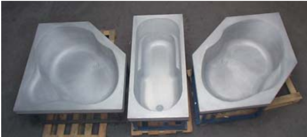
vacuum moulds ready for production