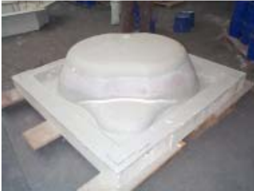
pattern without releaser