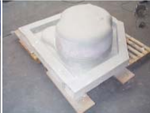
pattern without releaser