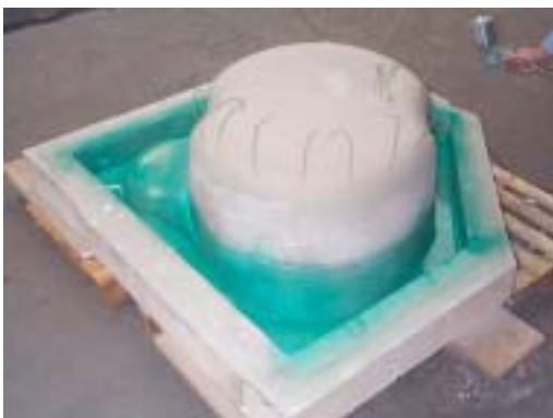
pattern with vacuum wires